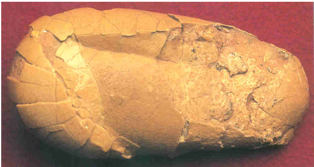
Colgate's Oviraptor Egg